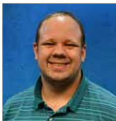
Taylor Munroe Social Media/Photography